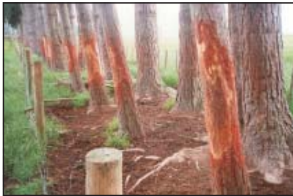
Stock damage by Fresian bulls to a shelterbelt of Pinus radiata.

The best time to plant depends on the location. If you are not sure, check with your neighbours or a member of the local