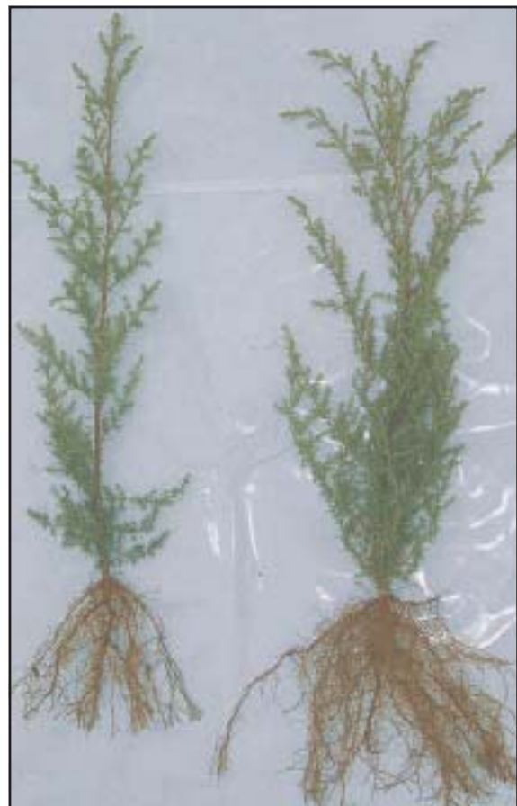
Good balance between roots and the foliage of these bare-rooted Cupressus lusitanica. Well prepared by the nursery for successful planting.

Check plant quality before they leave the nursery, making sure the roots are moist, that there are plenty of fine fibrous roots and several thicker anchoring roots.