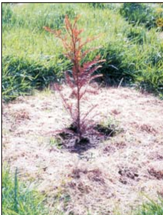
A well planted Sequoia sempervirens – pre-sprayed site, hole dug and bare-rooted specimen carefully planted with the soil replaced and firmed.