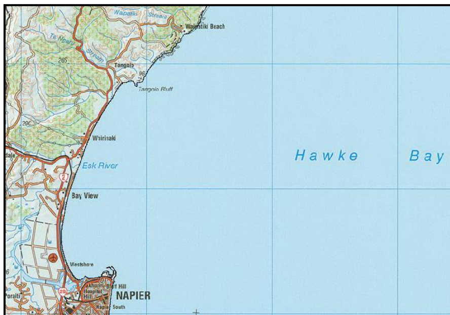
Figure 1: Site of activity - Whirinaki, Hawke Bay 6