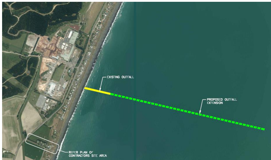
Figure 2: Site Plan Showing Outfall Extent and Location 7