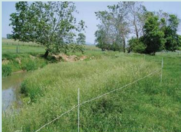
Riparian buffer and stock exclusion fencing on Muddy Creek.

BMP implementation began in the early 2000s. By 2003, the area of Muddy Creek used for drinking water no longer breached the drinking water standard, and the trend continued. In 2010, the stretch of river was removed from the list of impaired waters for nitrate-nitrogen impairment. The watershed remains impaired for aquatic life due to reduced dissolved oxygen levels.