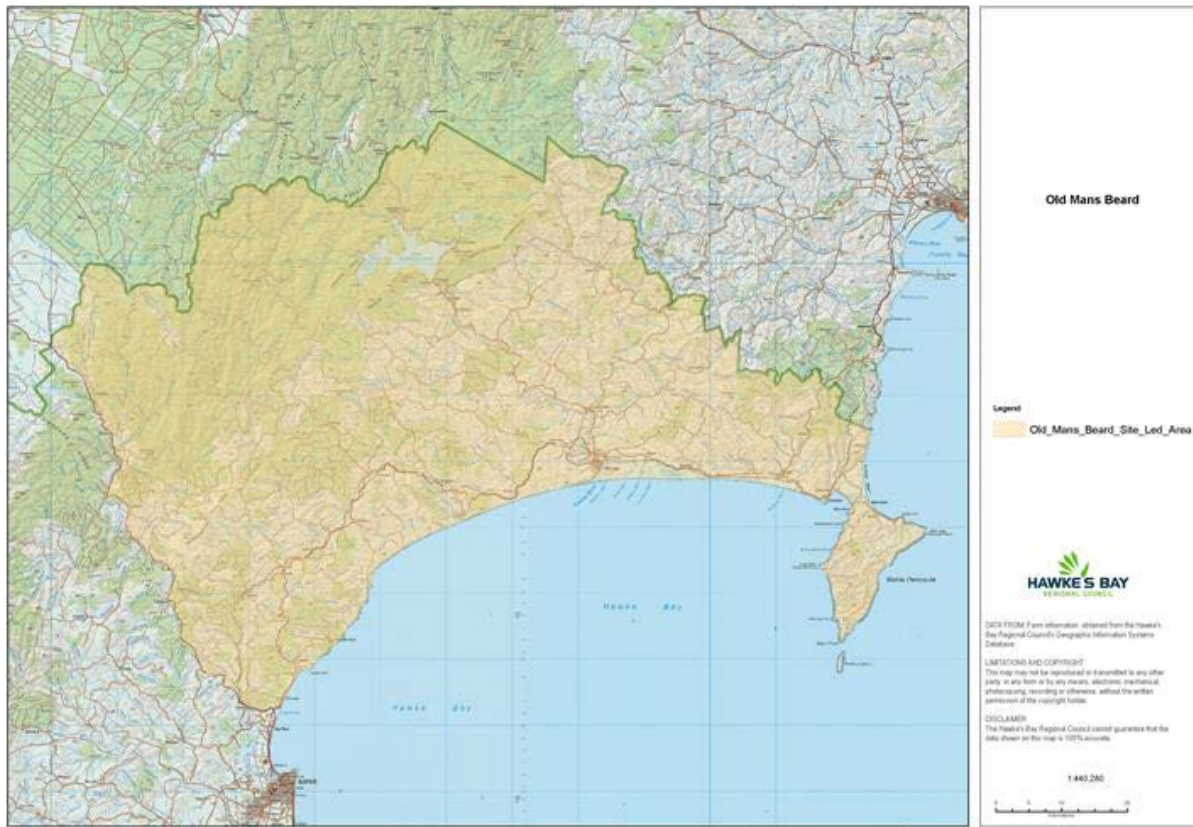
Figure 9: Old man's beard containment area