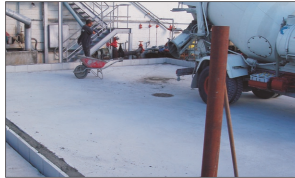
Construction of an outdoor storage bund. The grate inside the bund drains to trade waste.

A bund lets you detect and control any small or slow leaks and will contain spills from sudden ruptures of tanks and drums.