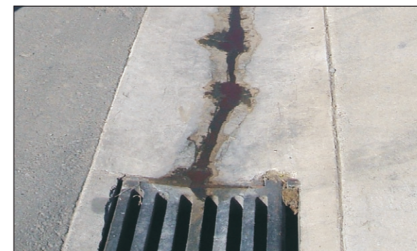
Stains on concrete are evidence of stormwater pollution occurring.