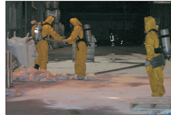
This site has a spill plan, so stormwater pollution from this spill was minimised.