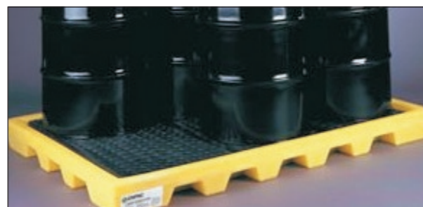
Spill pallets are an easily transportable spill solution.

If your site is rented, consider purchasing portable bunds or spill pallets that can be taken with you if your company relocates.