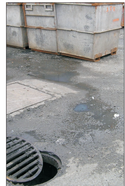
Ongoing contaminated runoff discharging to stormwater as a result of poor housekeeping