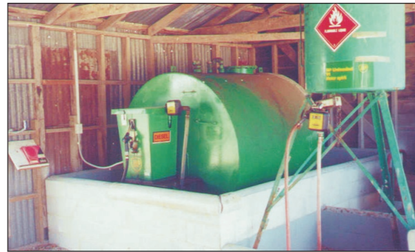
The most effective bunds are able to contain large volume spills, and are under cover to prevent them filling with rainwater.