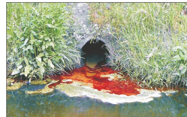
Industrial pollution in stormwater

Enforcement action may be taken against your company if stormwater is polluted – either deliberately, by accidental spills that aren't properly cleaned up, or if reasonable steps weren't taken to avoid the entry of spilt material into the stormwater system.